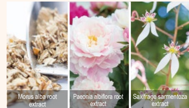
Morus alba root extract